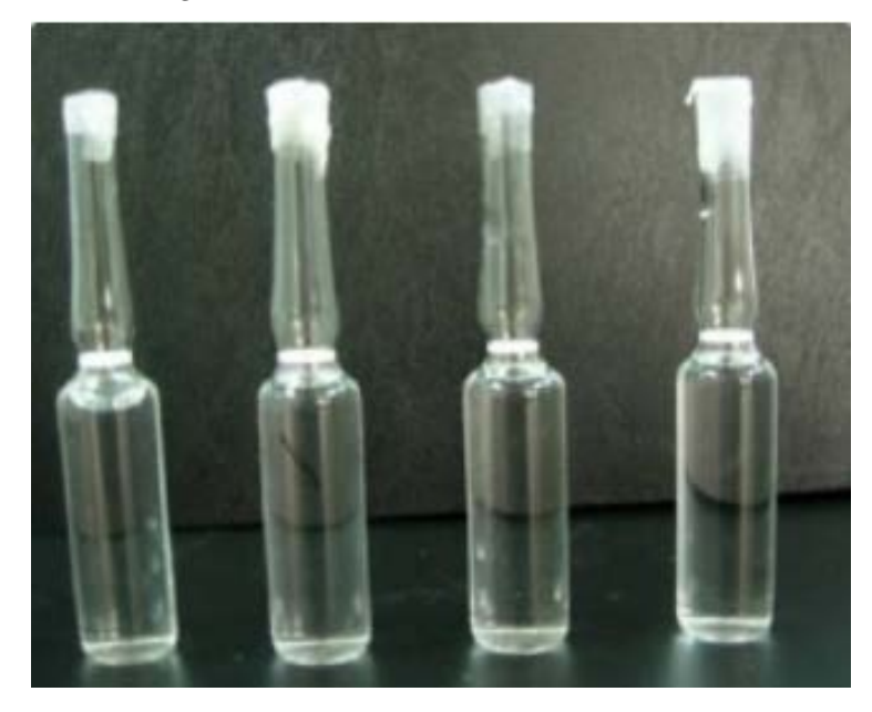
Figure 3. Fricke dosimeter solution in a glass ampoule (Agensi Nuklear Malaysia, 2011)

A dosimeter is a device used to measure the absorbed dose, equivalent dose, kerma, and exposure of radiation whether it is measured directly or indirectly. There are many types of dosimeters used based on certain circumstances, which are film dosimetry, luminescence dosimetry, semiconductor dosimetry, alanine dosimetry, plastic scintillator dosimetry, diamond dosimeter, and chemical dosimeter (Galante, 1999). Fricke dosimeters are categorized as chemical dosimeters and are often used in the food irradiation process to measure the absorbed dose. In the Fricke dosimetry system, the absorbed dose is determined by measuring the chemical change produced by the radiation in the volume of the Fricke dosimeter solution. Fricke dosimeter solutions as shown in Figure 3 are very sensitive to ionizing radiation.