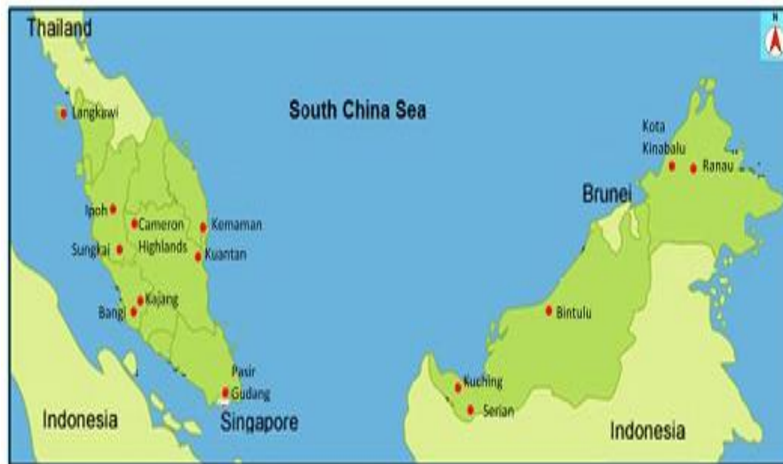
Figure 1: Radon and thoron measurement locations

The air containing radon and thoron gas will be drawn by the pump and transferred into detector chamber (RTM1688-2). Radon and thoron gas decayed to progenies by emitting alpha particles which will be subsequently counted by the semiconductor detector and analysed using Radon Vision software. The radon and thoron gas concentrations were reported in \text{Bq m}^{-3} . While, the sampling of radon and thoron progenies was performed by pumping the air passes through the filter paper. The deposited radon and thoron progenies on the filter will automatically be counted by the semiconductor detector (DosemanPro) and also analysed using Radon Vision software. The radon and thoron progenies concentrations were reported in term of equilibrium equivalent concentration (EEC) in \text{Bq m}^{-3} .